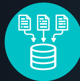
Data Centralization & Workflow Digitization

To digitize and automate labor-law case handling for greater efficiency, transparency, and cost reduction.