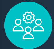
Collaboration & Reporting